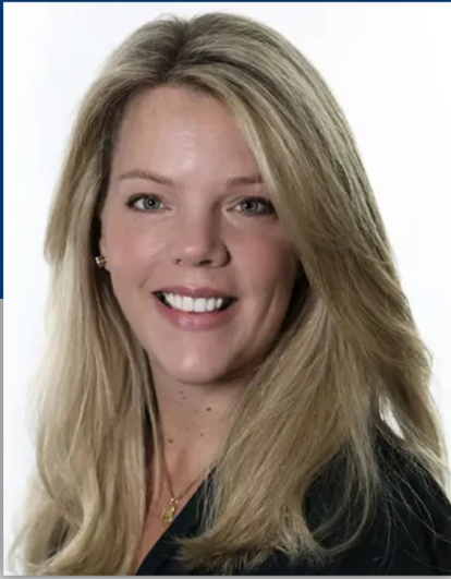
SENATOR ALEXIS WEIK