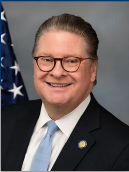
SENATOR PETER HARCKHAM