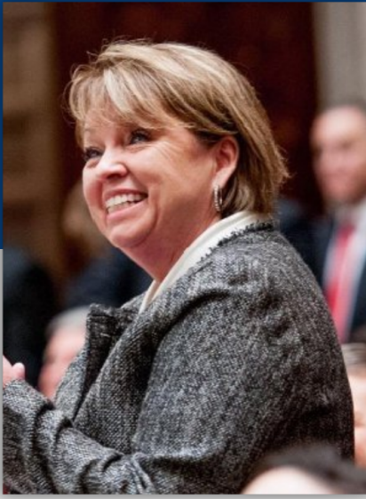
SENATOR PATRICIA A. RITCHIE 48TH SENATE DISTRICT